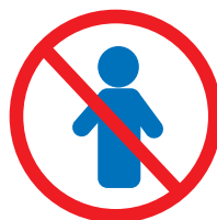
Children under 6 admitted only with parent or guardian