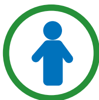
Tested swimmers permitted to enter alone