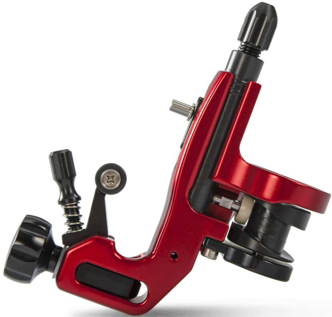
Stigma Tattoo Machine