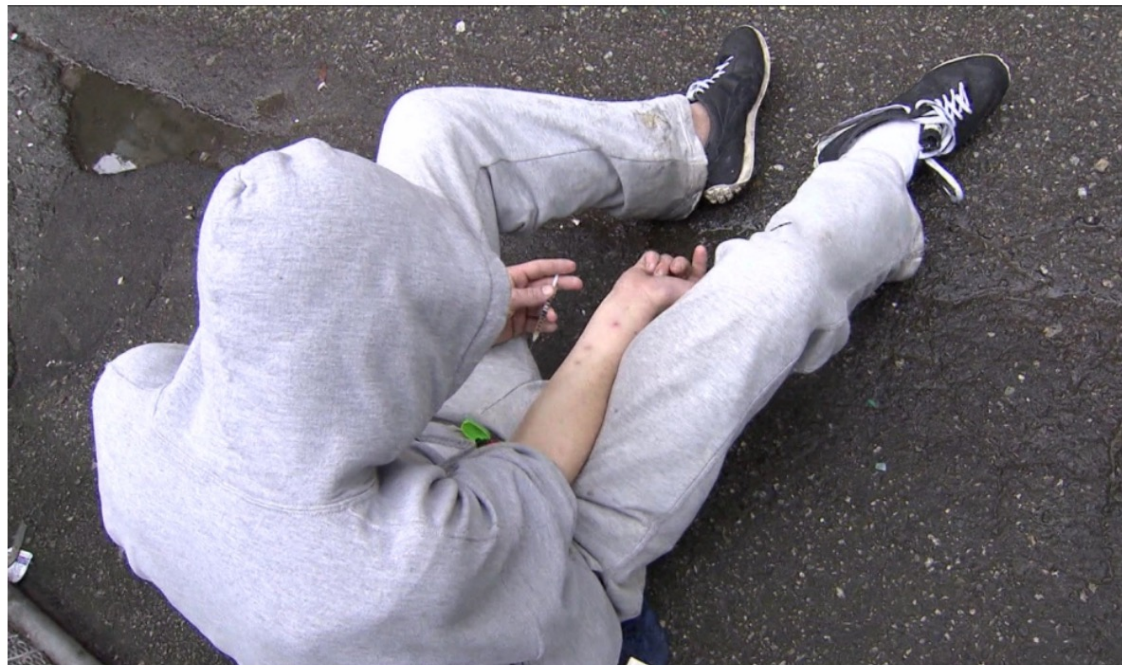
This is second spike in overdoses this year in Timmins, with the first being in early March.